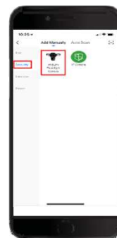
Figure 3. Select Product