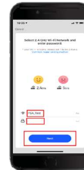
Figure 5. WiFi Login