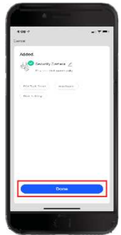
Figure 7. Success !

Tip #1: The Floodlight Camera LED should have turned solid Blue.