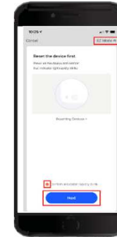
Figure 4. EZ Mode